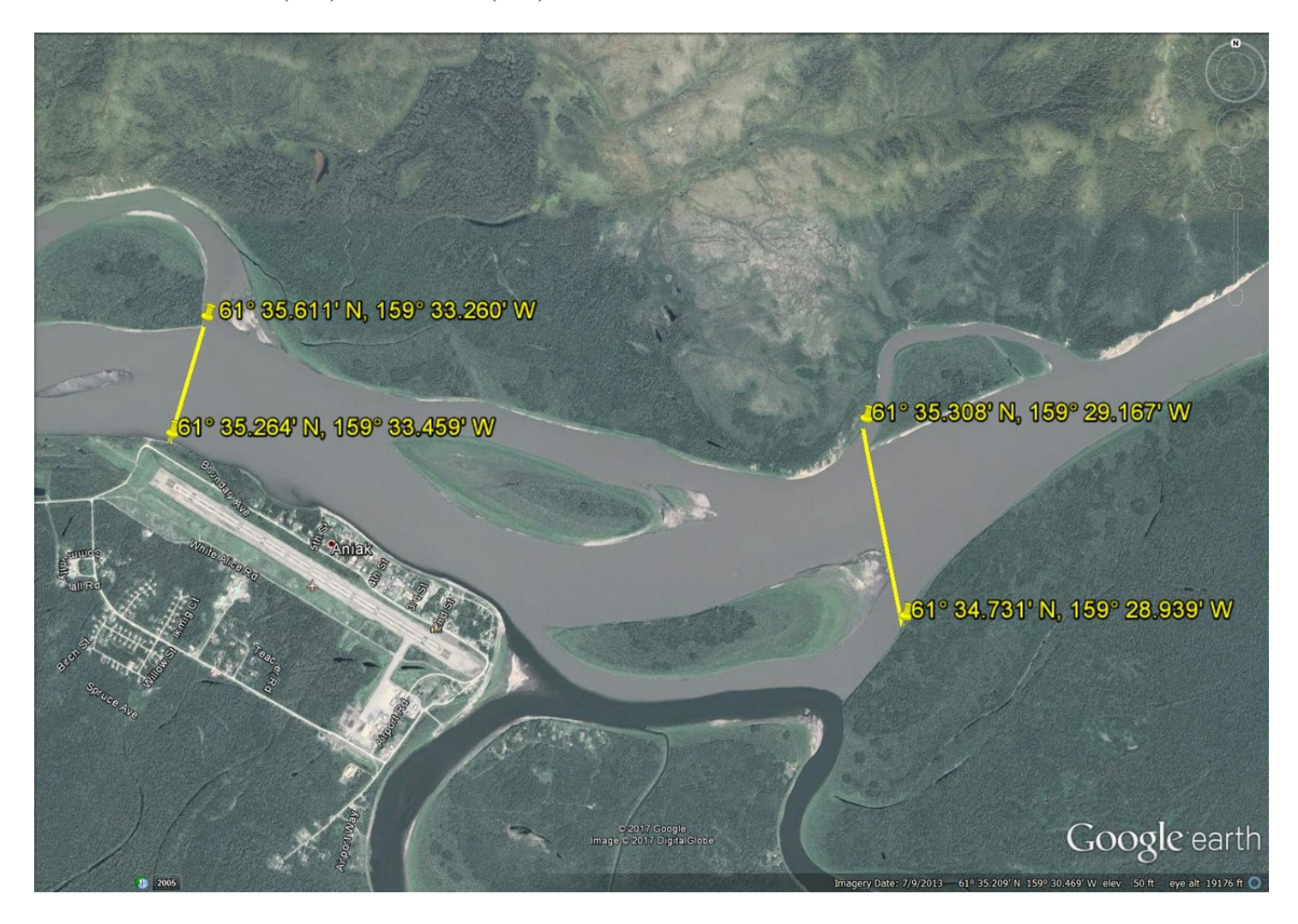
Figure 1.— Map of Aniak area closed waters.

For information regarding federal subsistence fishing regulations and any announcements, please contact the Yukon Delta NWR at (907) 543-3151 or (907) 543-1002.